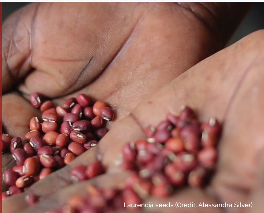
Laurencia seeds

From rural Tanzania to urban Senegal, diverse locally adapted models of nutrition-sensitive agriculture can help empower women, engage men, and improve health and nutrition outcomes for entire families