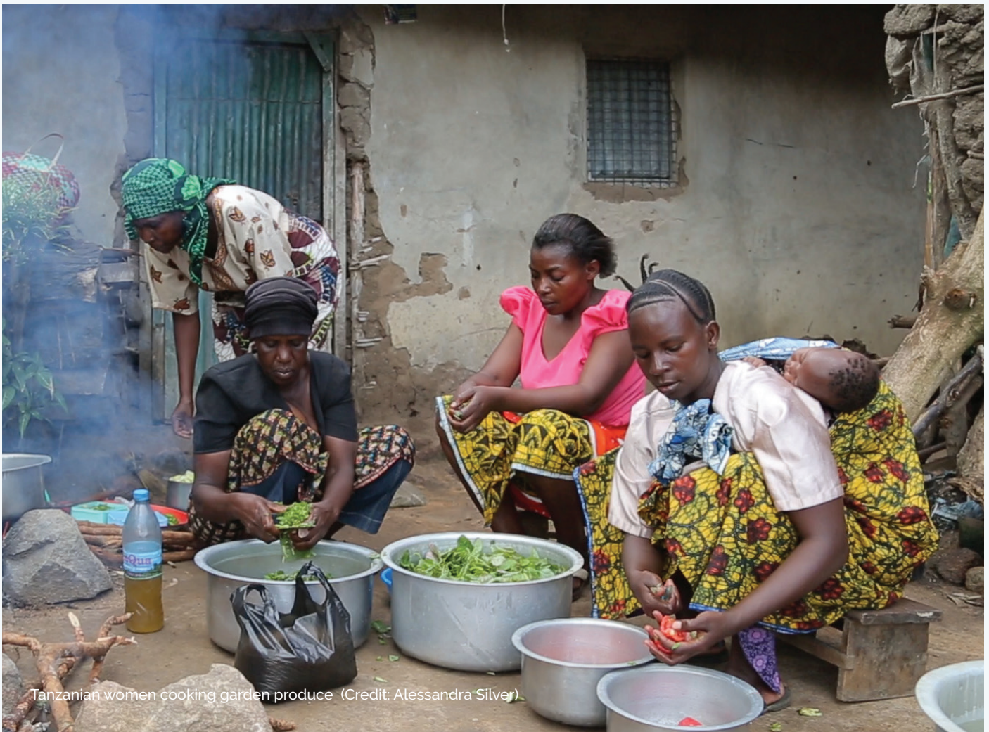
Tanzanian women cooking garden produce